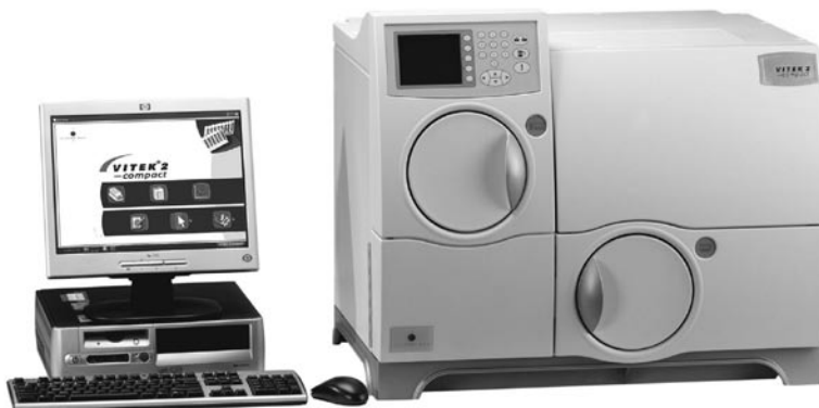
Figure 1. VITEK 2 Compact Instrument and Workstation.